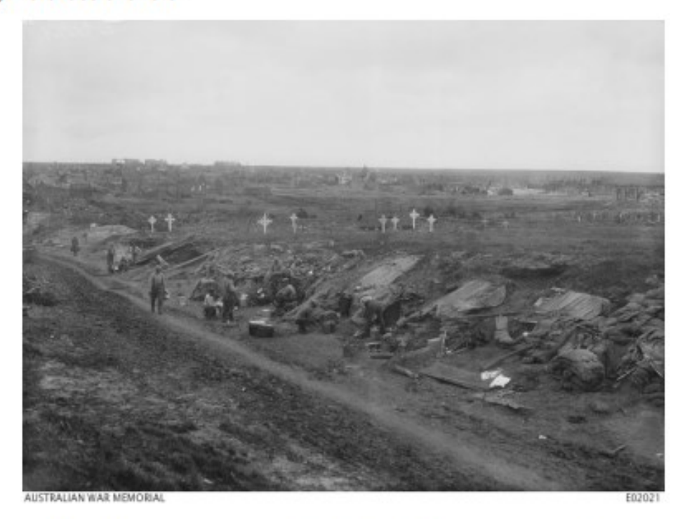
Troops billeted in a sunken road near Bullecourt, in France, during the fighting of the Australian troops in that sector.

Following the second battle, Charles Bean remarked, "The Second Bullecourt battle was, in some ways, the stoutest achievement of the Australian soldier in France. Such success as the Australians achieved had been won by troops persisting through the sheer quality of their mettle, in the face of errors".