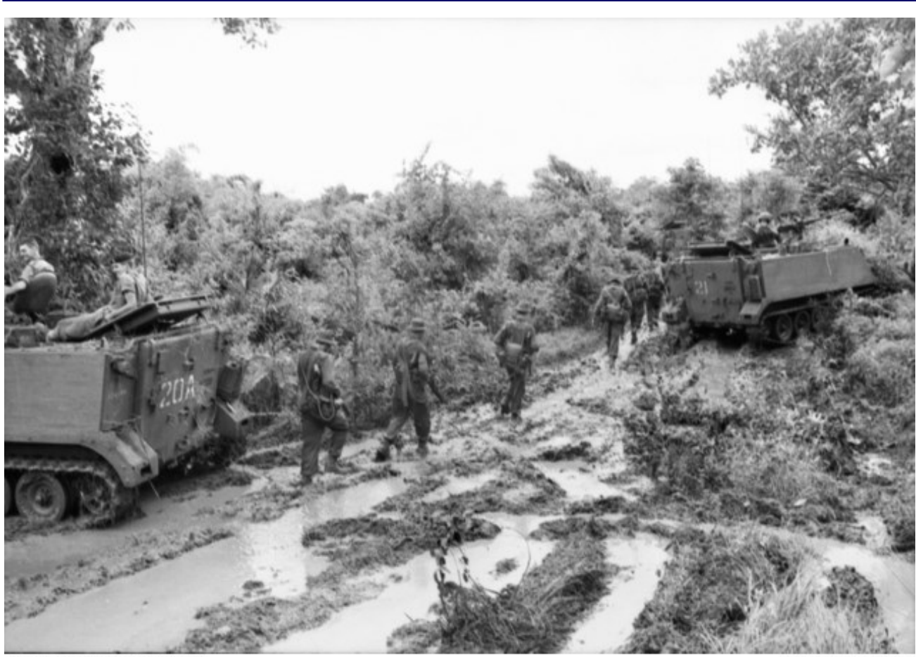
Image: Exhausted soldiers from 6RAR search for Viet Cong Forces on the day after the battle of Long Tan. 19 August 1966.

Learn more: https://www.awm.gov.au/articles/event/vietnam