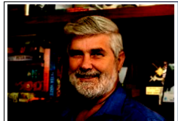
DAVE SABBen MG

Once your order is received, we will contact you before posting to ask how you would like the book(s) endorsed by the author. In this case, your phone or email contact details will be required.