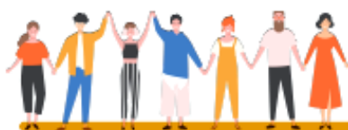
Pre 1999 The War Widows Guild of Australia NSW

OUR MISSION: provide the defence and veteran family community with a voice, facilitate access to services, entitlements; and support their social and emotional wellbeing.