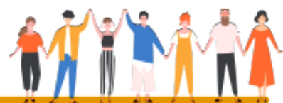
2024 & beyond Families of Veterans' Guild

I feel honoured to be part of the original veteran families guild - war widows. nsw