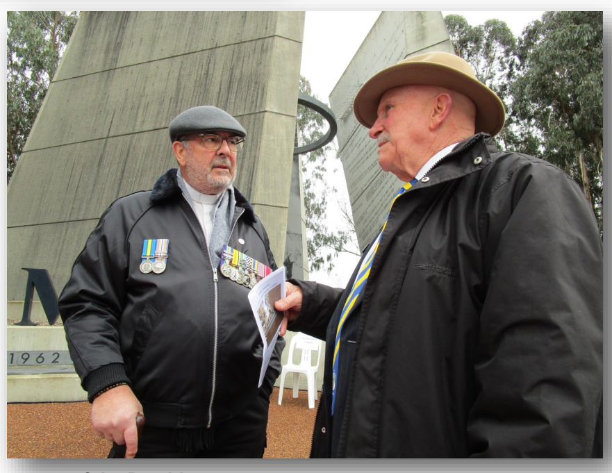
...one of the Presidents men ....