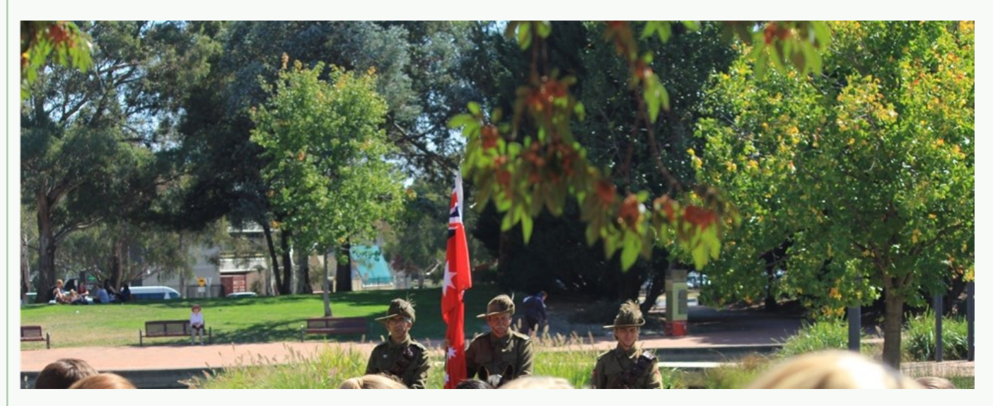
Don't forget 10.30 on 2 April 2020 Thursday